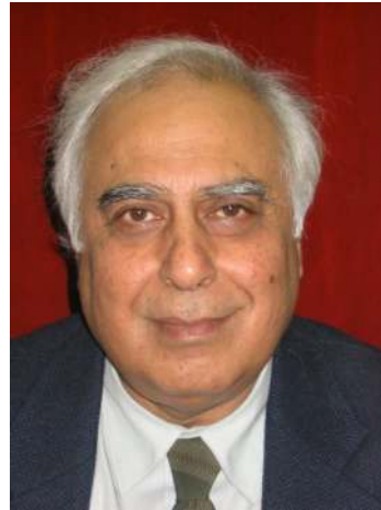
Shri Kapil Sibal

"Auroville is larger than life, Auroville is much more than India. Auroville encompasses within itself the spirit of the world, the spirit of human beings. What you are doing in Auroville is what I think the world community should be doing..... In diversity, you discover the unity of the human race. That is the celebration of Auroville. Let's all celebrate it and take it forward."