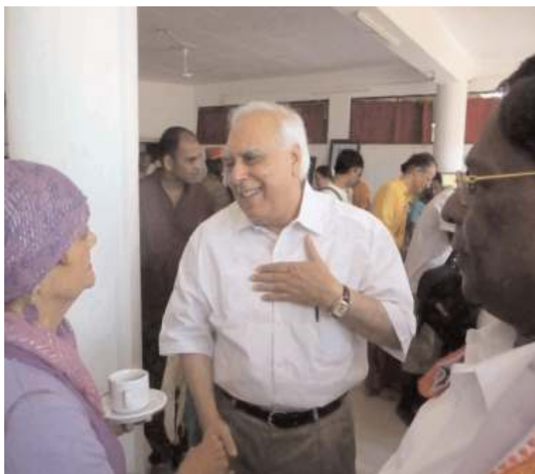
Human Resource Minister Shri Kapil Sibal (middle) in informal conversation with an Auroville resident during tea after the book release. Shri V. Narayanasamy, Union Minister of State for Planning Parliamentary Affairs and Culture, looks on.

On 12 th July 2010, Auroville was honoured by the visit of Shri Kapil Sibal, Human Resource Development minister and Shri V. Narayanasamy, Union Minister of State for Planning Parliamentary Affairs and Culture. The main purpose of their brief visit was to release an illustrated educational book “Passage” prepared by teachers and students of the Last School. The book was published by Sri Aurobindo International Institute of Educational Research, SAIIER, Auroville. However, it was a pleasant experience for us when in his address to the community, Shri Kapil Sibal dwelt on his philosophy of life, his aspirations and thinkings. From that and from his informal meetings with the Aurovilians, we had the glimpses of a person whom we would