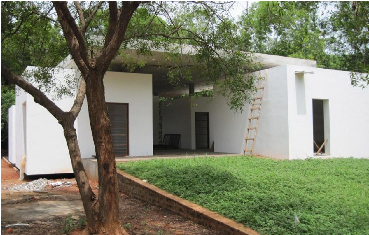
Phase 1 – almost completed