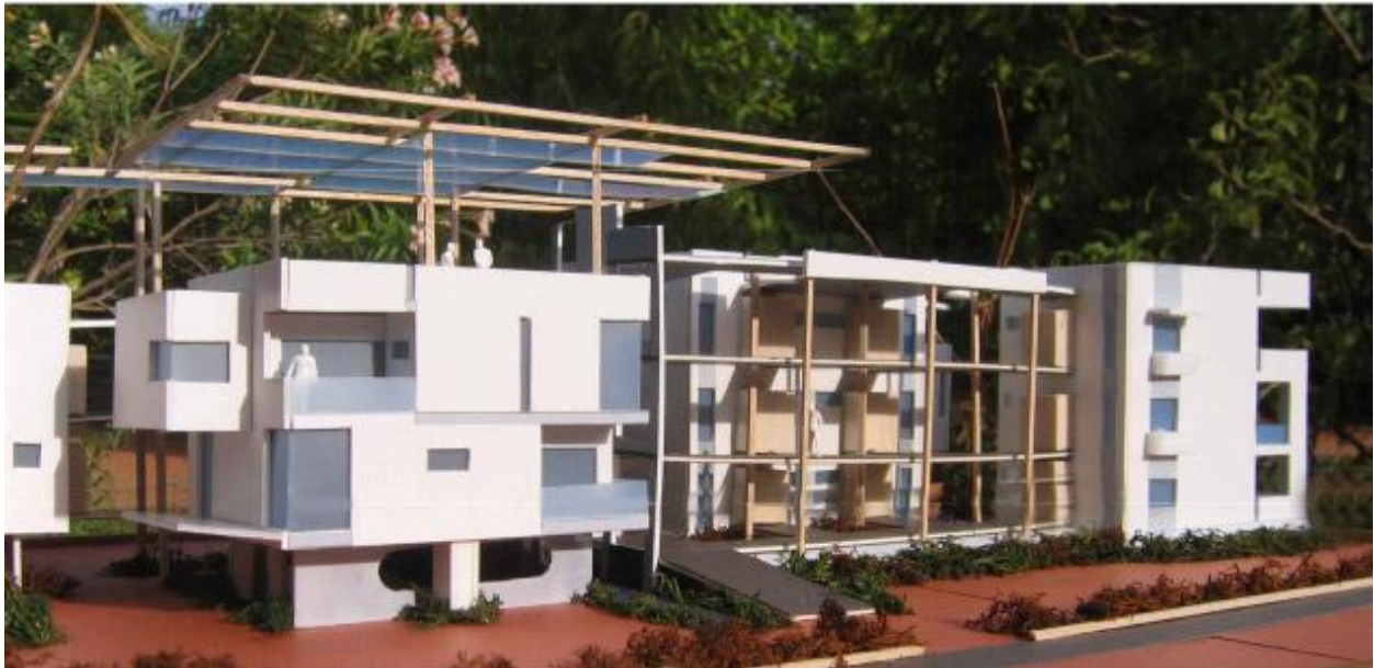
Model of Inspiration

Also the building is designed as four different blocks accessed by one staircase and connecting passageways.