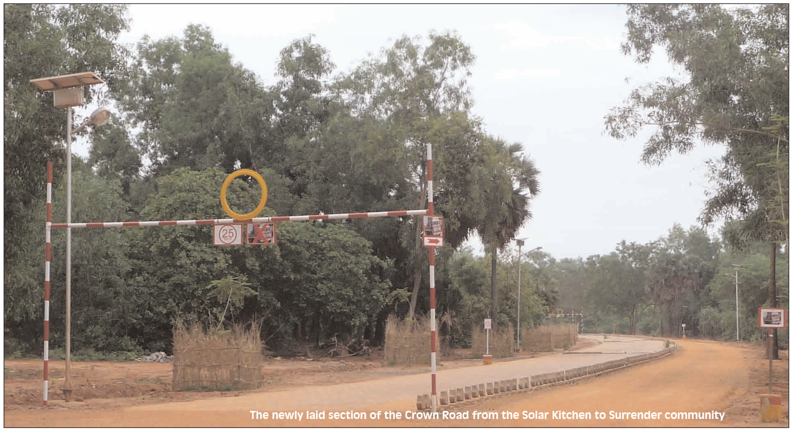
The newly laid section of the Crown Road from the Solar Kitchen to Surrender community

For this issue we talked to architects and planners who have devoted a great deal of time and thought to the issue of planning in Auroville. While there are clear disagreements concerning the pace and type of development that need to be adopted, everybody is agreed that the time has come to create a denser, more urban environment. But how? And what will it look like?