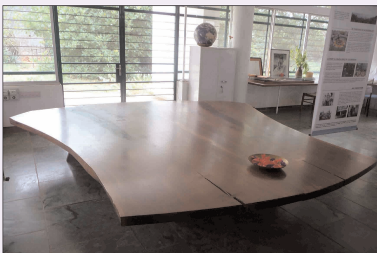
The Peace Table for Asia in Auroville at its temporary location

Contributions for the Peace Table for Africa can be made at www.nakashimafoundation.org . For more information regarding the completion of the Hall of Peace in Auroville, please contact unity@auroville.org