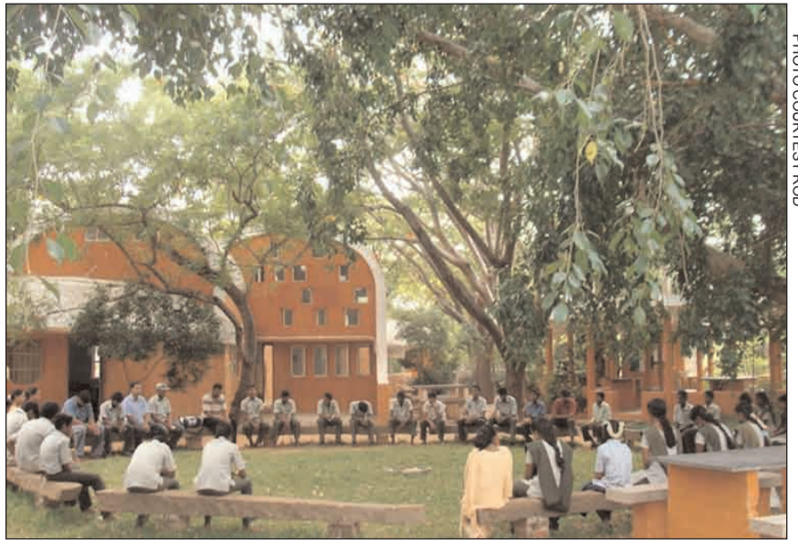
Morning assembly at NESS

"If there is a common or comparable preparation, the students who leave