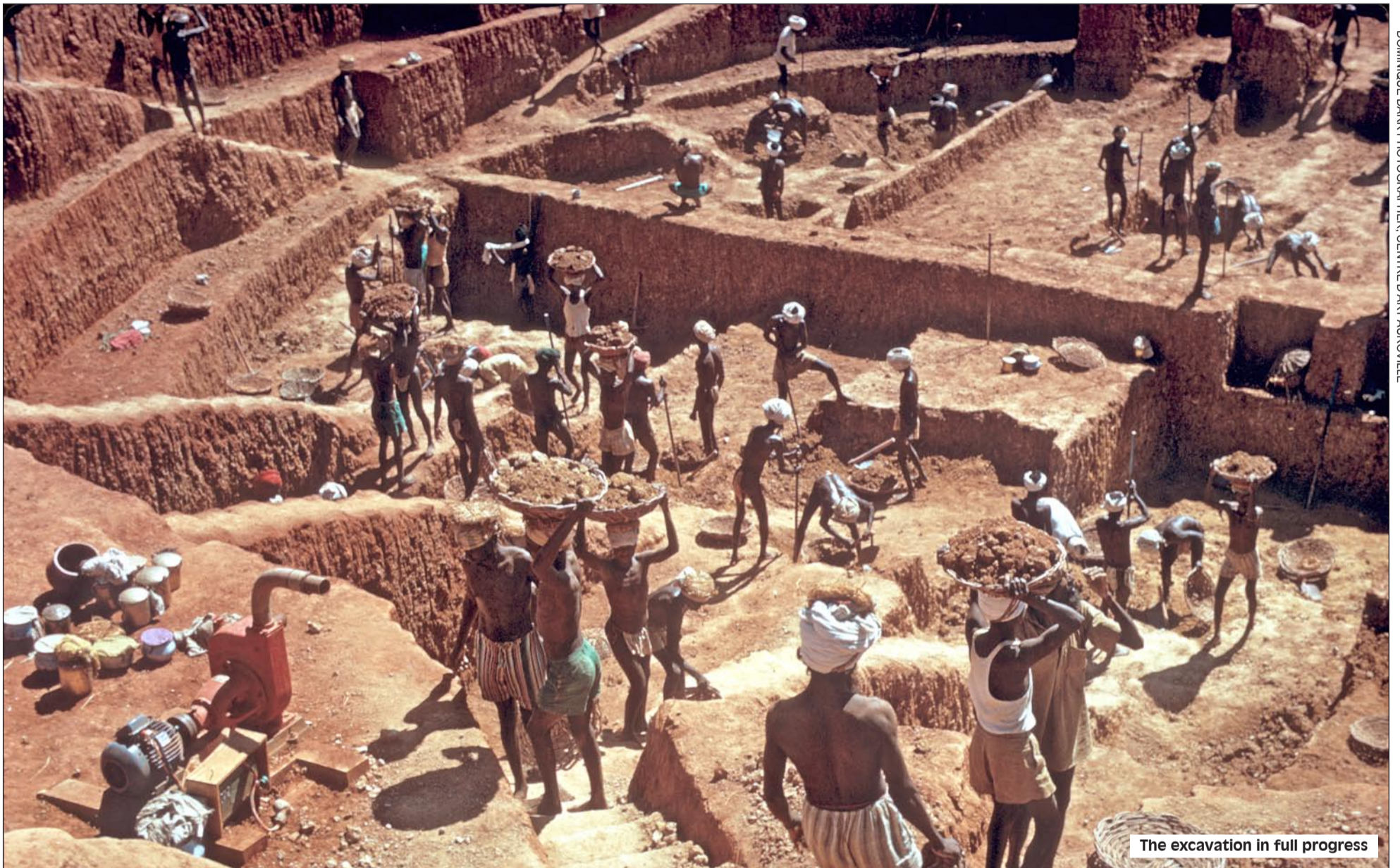
The excavation in full progress

Auroville's monthly news magazine since 1988