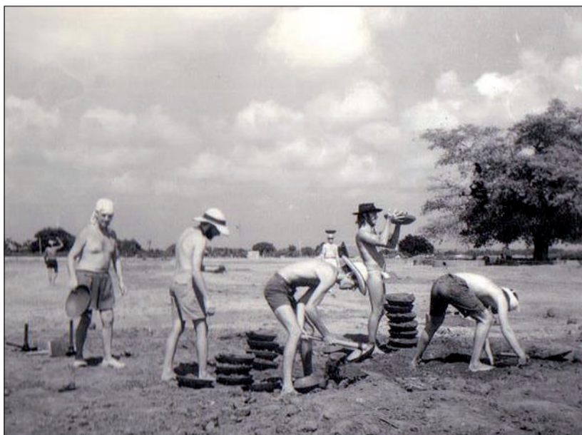
Early Aurovilians starting the excavation.